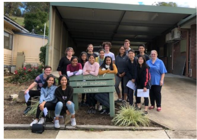
Medical students visit