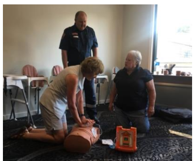
Facilitating a community education session

Bush nurses are adept at operating within extreme conditions such as bushfires, droughts and floods. They are at the forefront of working with ageing communities as young people leave the areas for work opportunities. In addition, they face funding issues whilst serving increasingly complex health needs. Time management is a challenge given the ratios of staffing to service areas. Bush nurses increasingly and by default, provide primary health care services in addition to their clinical roles.